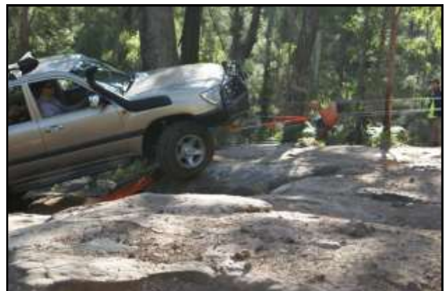
Grade 5: Winching in the Rock Garden, Yalwal