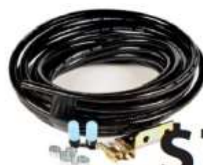
Bushranger 3 Piece Digger RRP $88