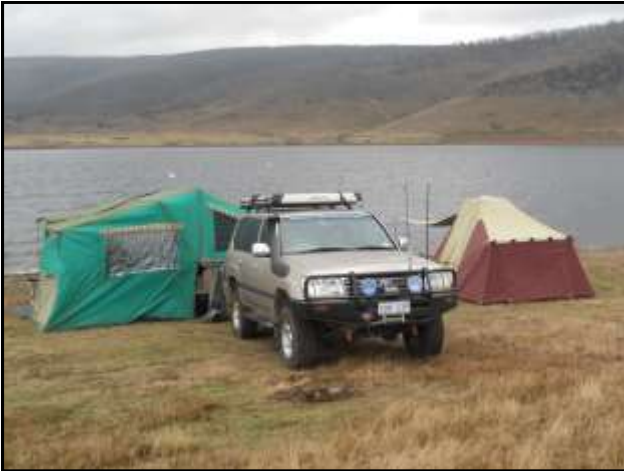
Grade 2: Tantangra