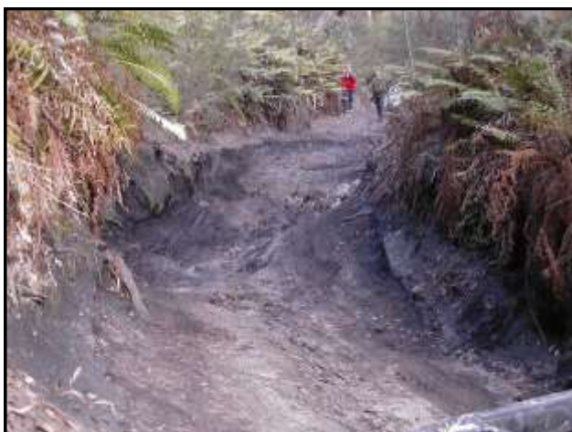
Grade 3: Track at Lithgow