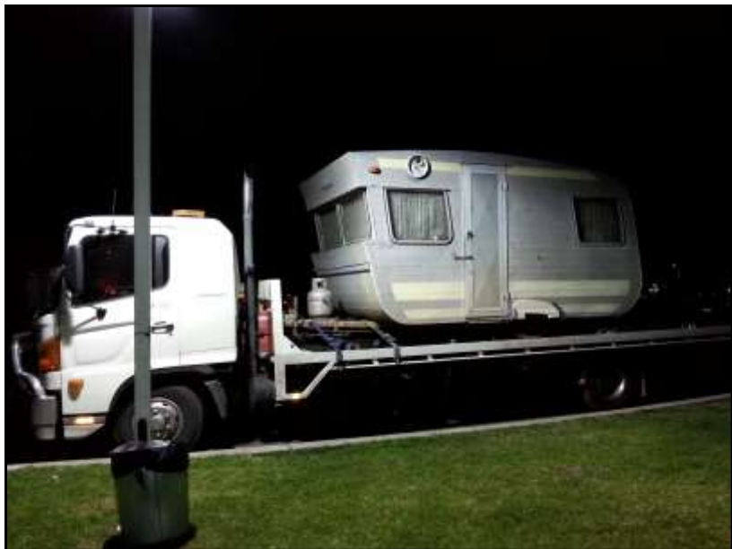
Recently spotted at Pheasants Nest: 'now that's a slide-on camper!' Have a vision, but be flexible!

Well, that's the saga. It's been an interesting year and a half journey configuring the rig, and I have enjoyed the various challenges, but I am relieved it's nearly over and we can concentrate on other things like going on and leading trips. For you, dear reader, I hope the story was interesting and that there are some useful takeaways from our experiences.