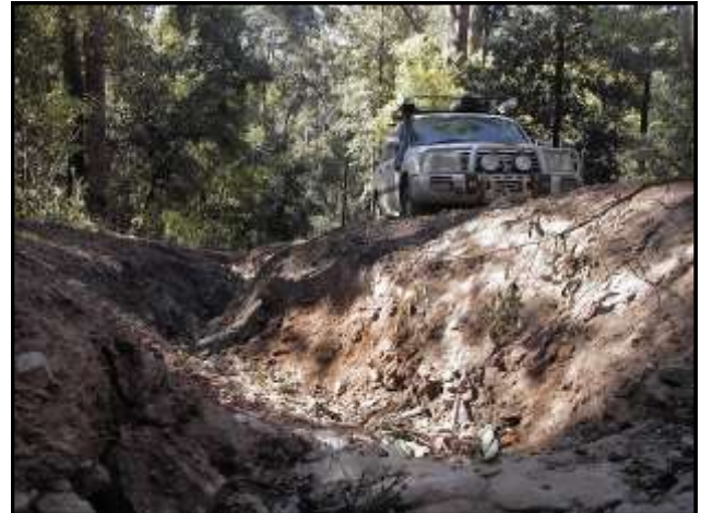
Grade 4: Ruts at Monkey Gum