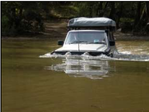
Grade 3: Crossing Dry Creek, Bendethera