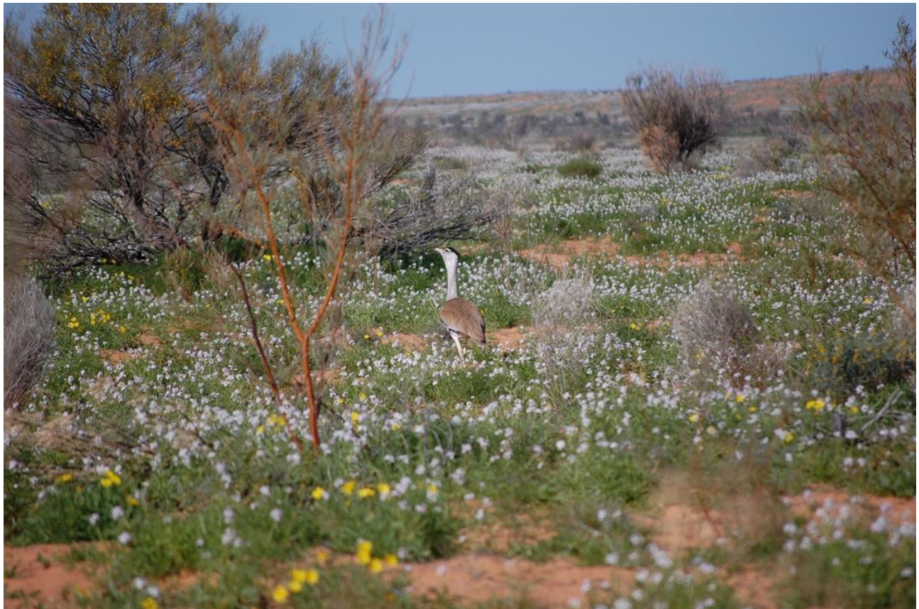
Australian Bustard amongst the desert flowers

Finn McGrath and Charles Jenkins (80 series)