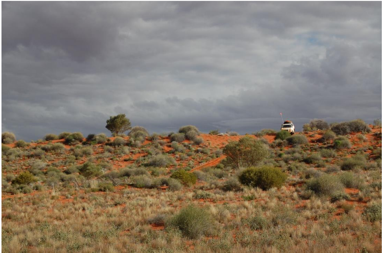
Crossing dunes north of Poeppel Corner

This was quite busy by Simpson standards, with groups heading for the Bash, but there was good communication and negotiation over dune crossings. At Poeppel Corner we turned north before the lake and things became much quieter. The track runs north to some old oil wells, then swings east over the dunes for a few hours before settling into the swale that eventually becomes the Hay River. These dunes are quite steep, and since the track has already developed the winding character that characterises the Hay River, some are crossed at odd angles.