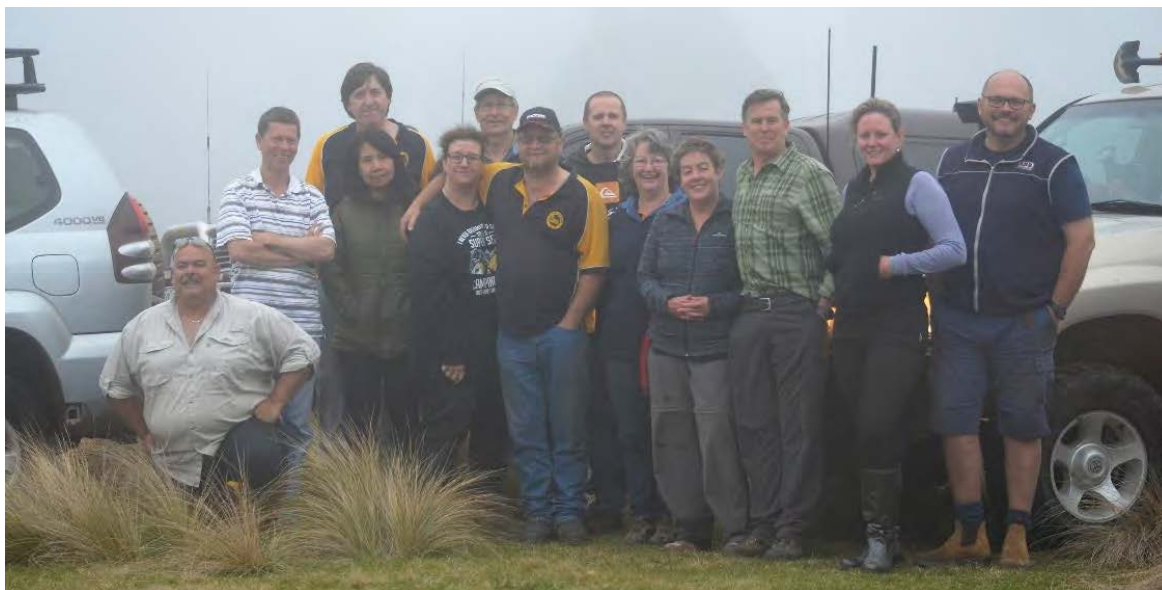
The Brogo Wilderness explorers...