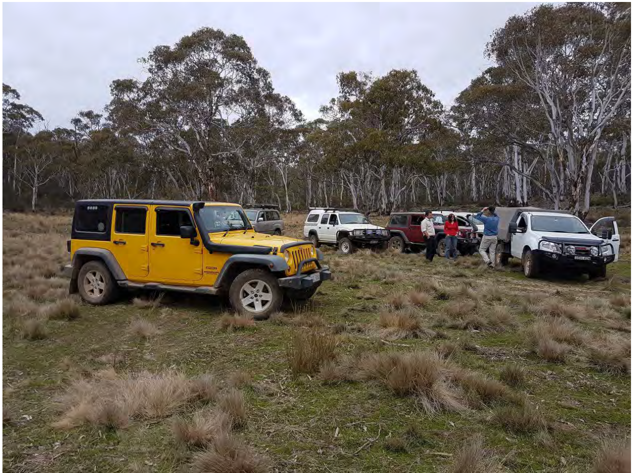
Basic Driver Training at Talooge